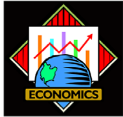
Microeconomics: Theory Through Applications